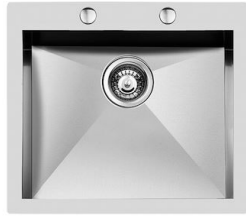
Sink Quadra 1216 050