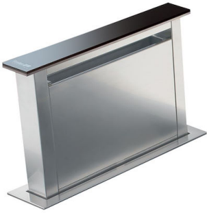
Hood S4000 Domino Ghost 2451 000